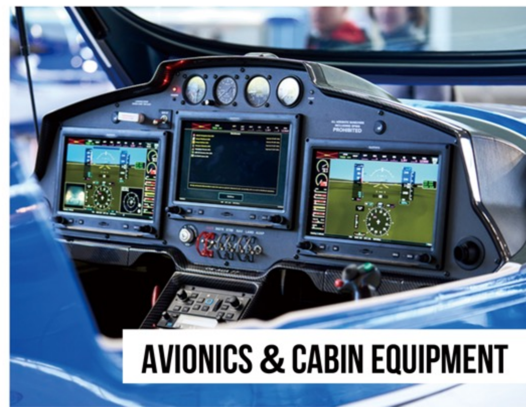
AVIONICS & CABIN EQUIPMENT