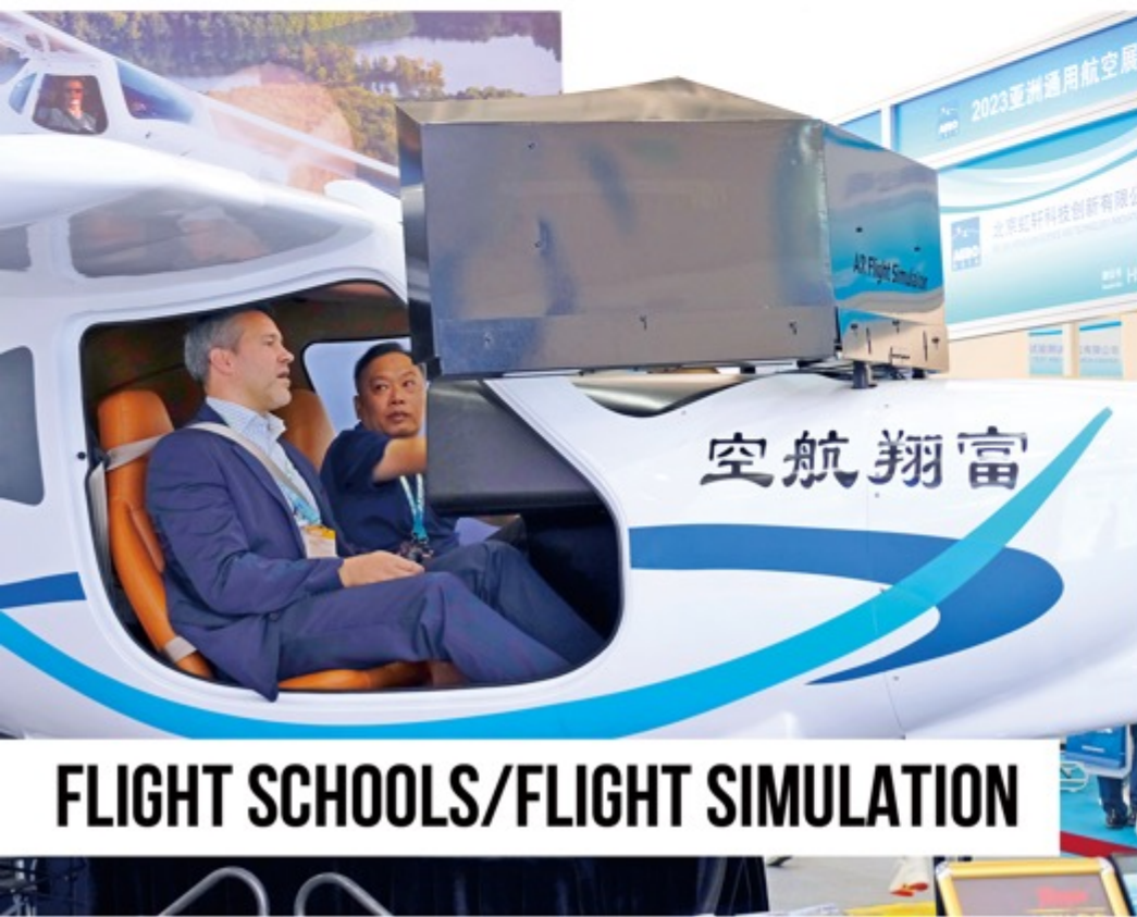
FLIGHT SCHOOLS/FLIGHT SIMULATION