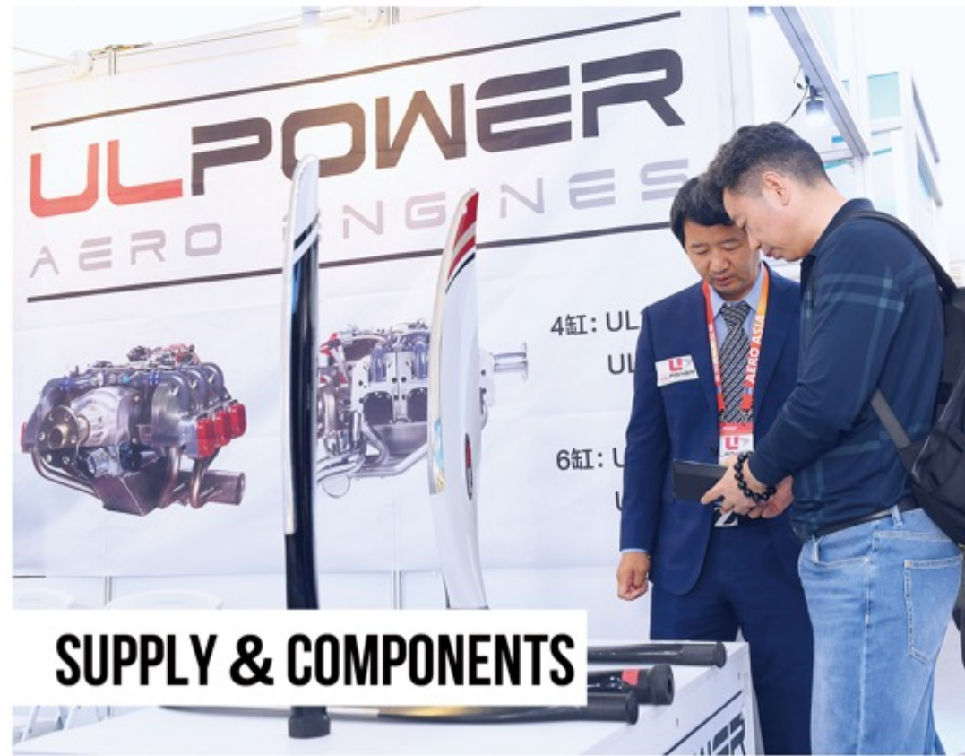
SUPPLY & COMPONENTS