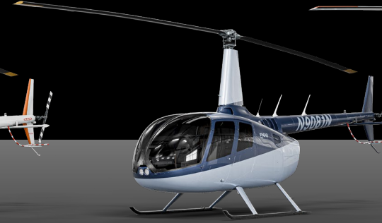
R66 N X G