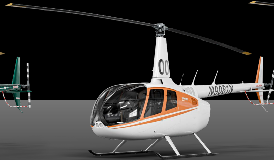
R66 A R M Y